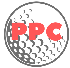
PREMIERE PRACTICE CLUB